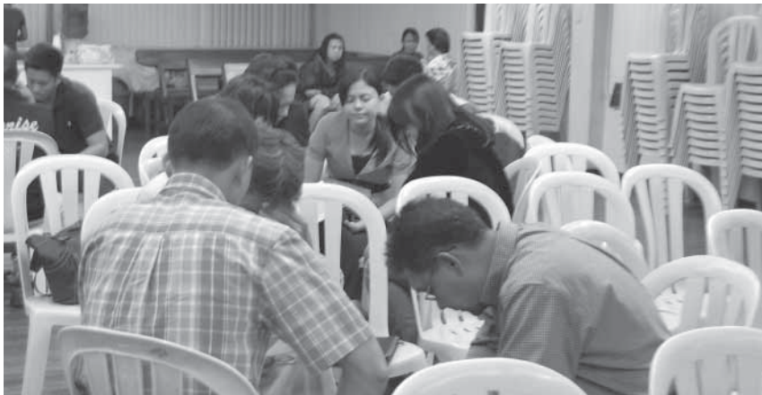
Joint prayer meeting with daughter churches.