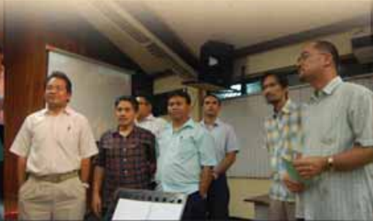
Pastors from KBCF outreaches