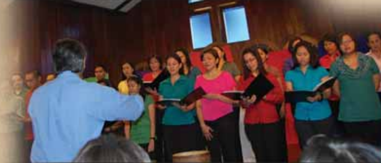
Excellence in Praise Choir