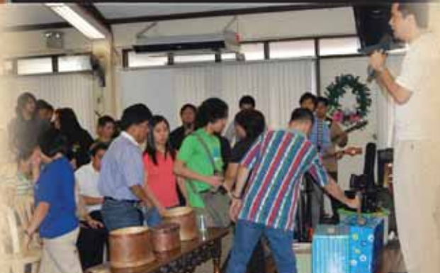
Everybody's Birthday Gift