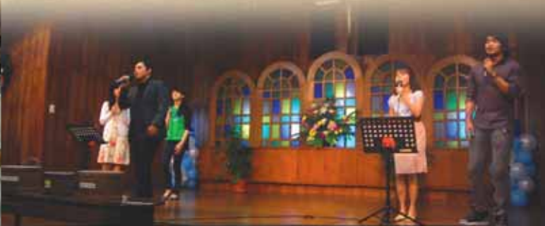
Evening worship team